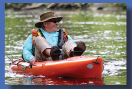
This program made possible by:

Email: specialprograms@cityofchesapeake.net Website: www.cityofchesapeake.net/paddle