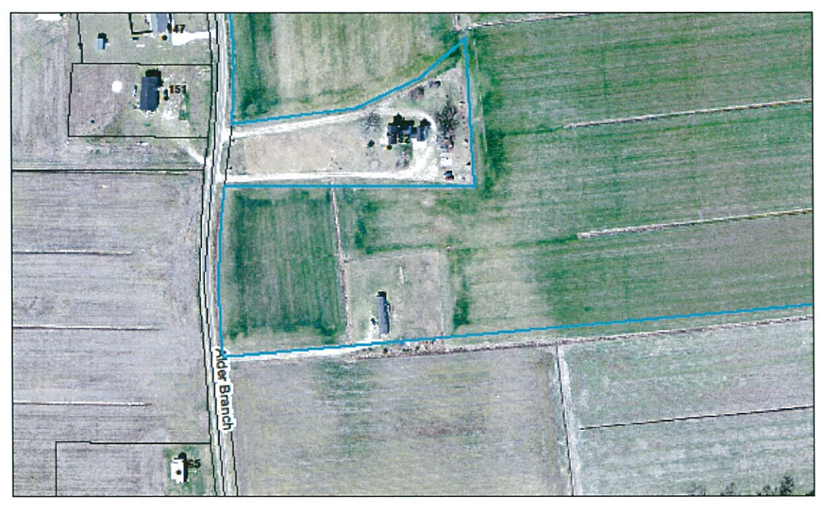
2008 Aerial of Property