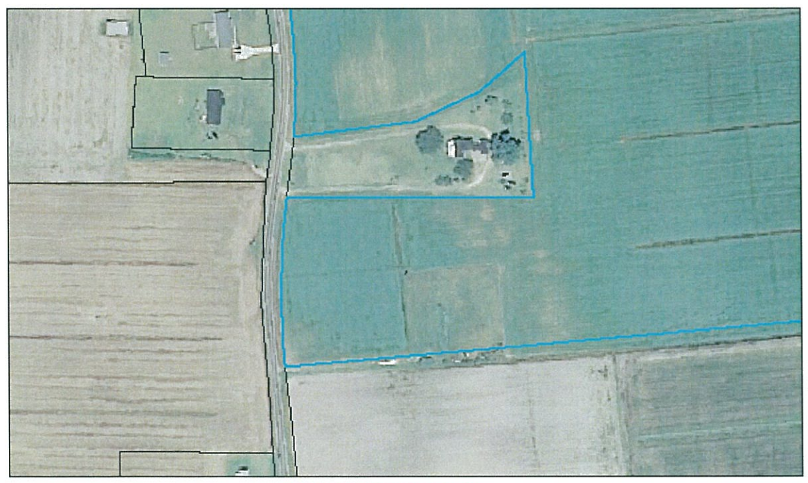
2009 Aerial of Property