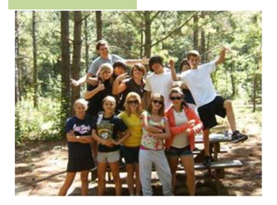
CamTech: A New Way of Learning

CamTech High School (CTHS) is beginning its sixth year on the campus of Camden County High School. CamTech is a "redesign" high school with the North Carolina New Schools Project. It is also the flagship global school for Camden County Schools' partnership with World View at UNC — Chapel Hill. CTHS offers honors classes and one-to-one computer access to students in grades nine through twelve.